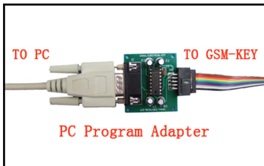
Simple RS232 program card ( Standard )

The bellow wire picture is to show how to connect the cable to the PC program connector with the Program adapter.Please connect it in the right direction with the picture.