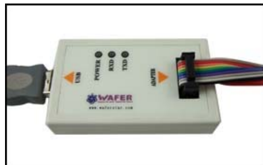
USB program adapter box (Optional Parts)